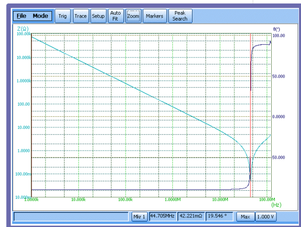
Simultaneous plot of impedance and phase displayed against frequency on a clear colour display

The 6500B series is best summarised by "Comprehensive and precise component tests at higher frequencies". The instrument is the perfect solution for those who have demanding component measurement needs.